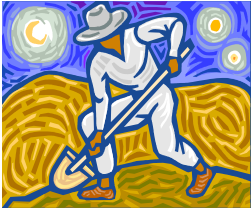
Rain or Shine