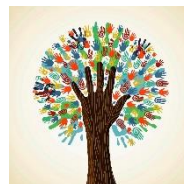
Neighbors Connecting Neighbors

City of Shoreline at shorelinewa.gov or (206) 801-2700